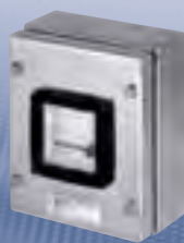
Type 414 81..